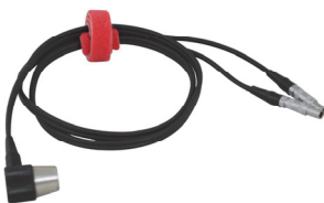
φ 10 Transducer