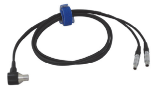
φ 6 Transducer