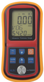
Ultrasonic Thickness Gauge